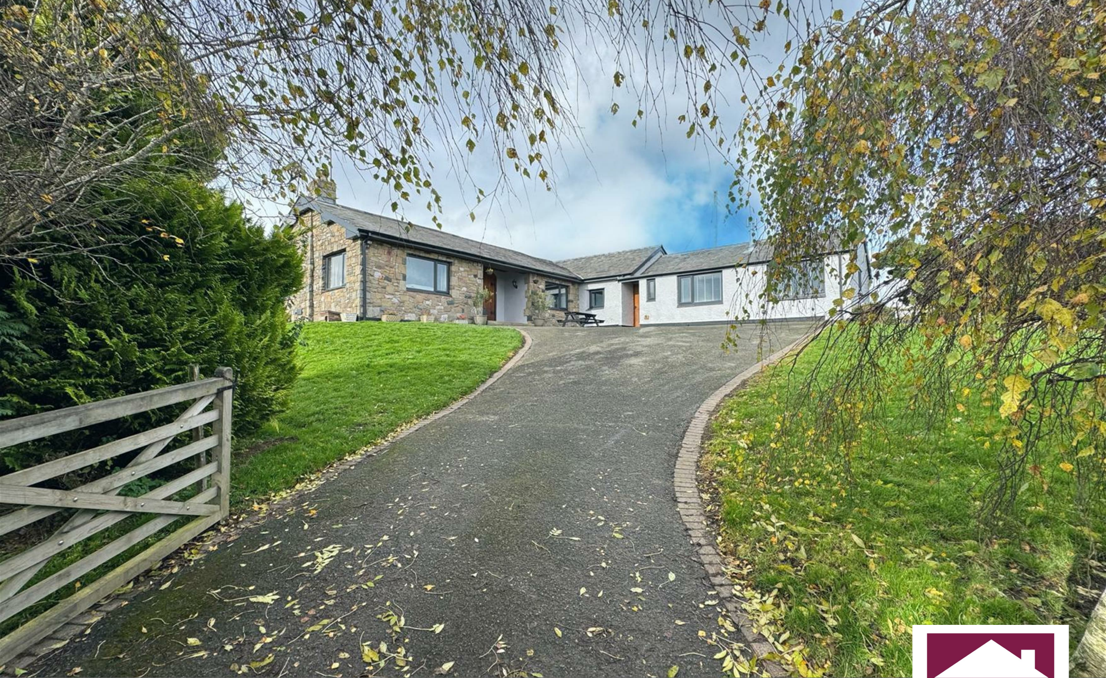
Ty Canol Llanelian Colwyn Bay LL29 6AY